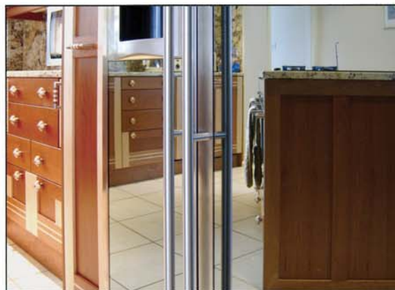
MAINSTAY DESIGNS: bespoke mirror fridge detail