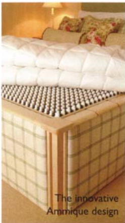
The innovative Ammique design