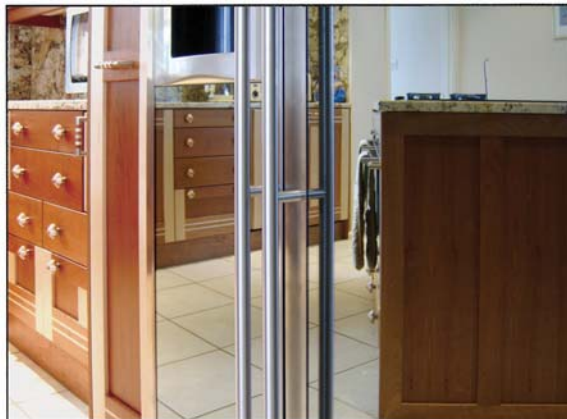
MAINSTAY DESIGNS: bespoke mirror fridge detail